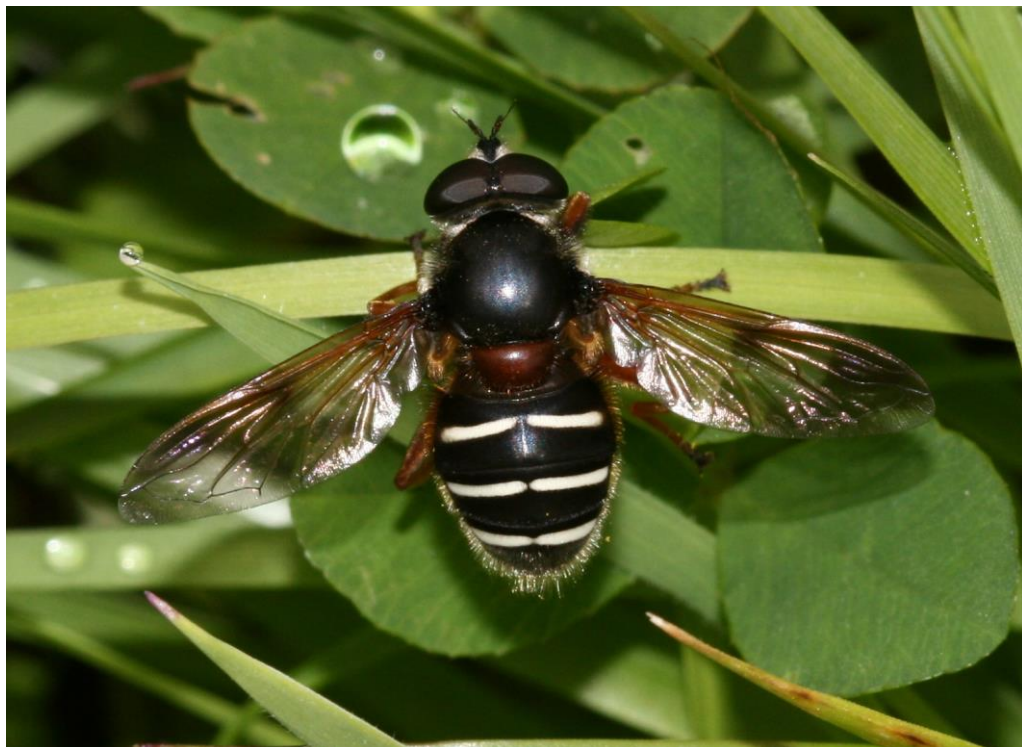
Male Hoverfly: Sericomyia lappona

ARCTOPHILA SUPERBIENS: Present at both lochs and breeds.