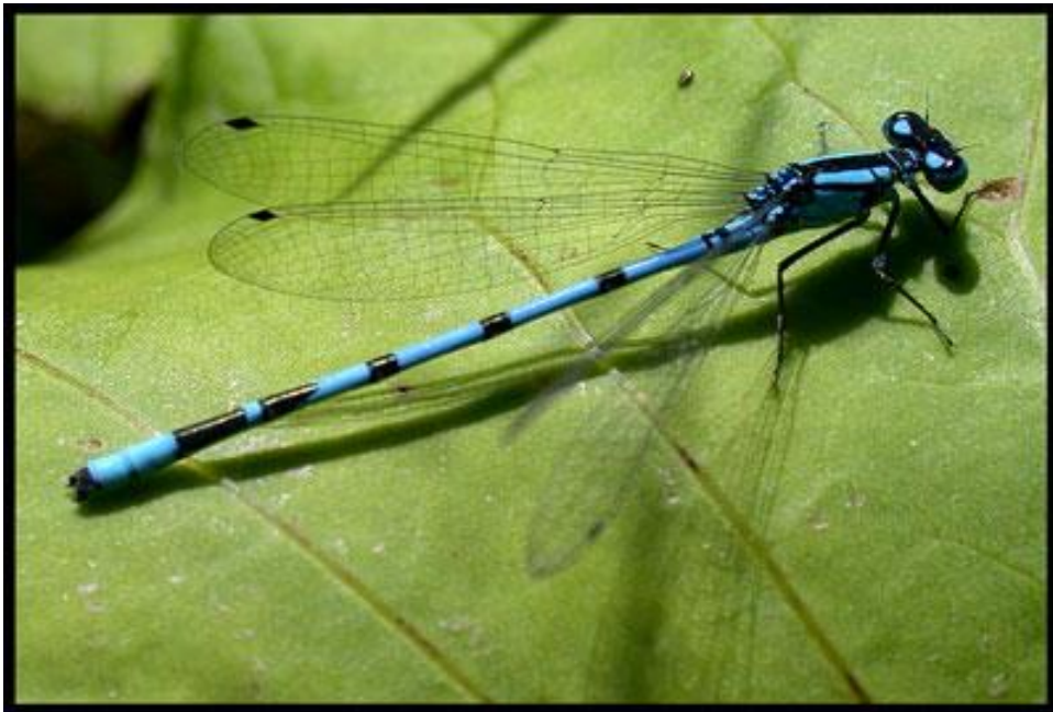
Male Common Blue Damselfly

LARGE RED DAMSELFLY: Present and breeds. Stronghold on the Valison Burn. Maximum number recorded: 28 on wing; 11 in cop; 6 ovipositing (AR).